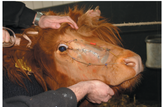
Figure 8. Catheters were sutured to each other forming two circles and to the skin to maintain nasolacrimal duct patency.