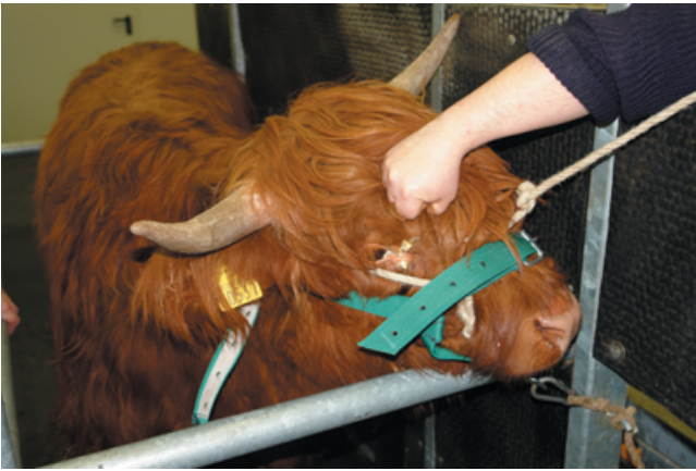
Figure 1. Purulent discharge on the OD and the right nostril.