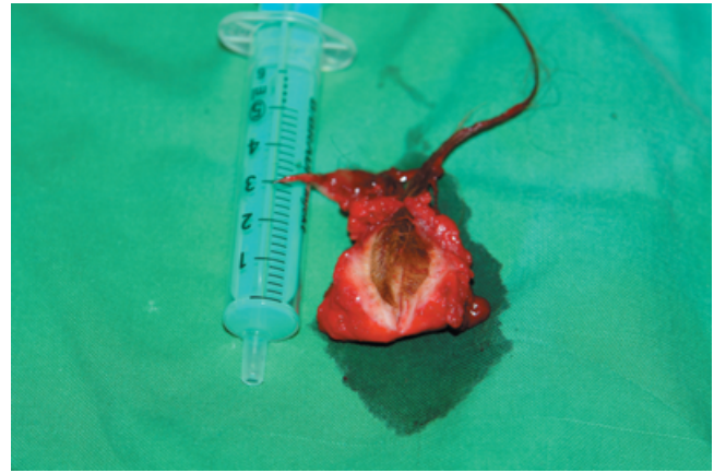
Figure 7. The dermoid cyst.

Gentamicin eye drops (Gentamicin-POS ® , Ursapharm, Saarbrücken, Germany) were administered topically five times a day for 2 weeks. Systemic antibiotic (marbofloxacin 2 mg/kg BW, Marbocyl ® , Vetoquinol, Ravensburg, Germany) and anti-inflammatory (flunixin-meglumine 2.2 mg/kg BW, Finadyne RPS, Essex Tierarznei, Munich, Germany) treatment was administered over 7 days after surgery.