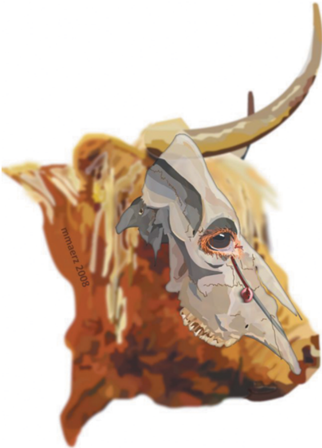
Figure 6. The cyst divided the osseous line between lacrimal and maxillary bone and entered the nasolacrimal duct. It filled the aboral part of the lacrimal duct completely with hairs from about 8–15 cm length.

bony part of the lacrimal duct, a bone drill was used to open the canal until the cyst was entered. Care was taken to avoid damage to the infra-orbital nerve, artery and vein (Fig. 5). Surgery revealed that the cyst divided the osseous line between lacrimal and maxillary bone and entered the nasolacrimal duct. It filled the aboral part of the lacrimal duct completely with hairs from about 8–15 cm length (Fig. 6). The cyst wall and the hair were completely removed (Fig. 7) and the remaining oral part of the duct was irrigated. Before closing the wound two catheters were passed through the superior and the inferior lacrimal puncta respectively towards the nasal opening. Catheters were sutured to each other forming two circles and to the skin to maintain nasolacrimal duct patency and remained in place for 2 months (Fig. 8).