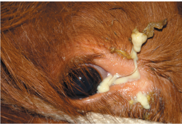
Figure 2. Massive purulent discharge on the OD.