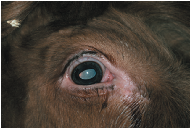
Figure 9. Final examination: the heifer showed mild serous discharge without any signs of discomfort.

hairs growing out of the inferior lacrimal punctum an anomalous nasolacrimal duct was suspected in this case. Congenital anomalies of the nasolacrimal system are rare in cattle. 5,11–13 Supernumerary openings of the nasolacrimal drainage apparatus and dysplastic lacrimal puncta have been described in calves. 11–13 Only one report described a dermoid cyst which affected the nasolacrimal duct in a bull. 5 Other facial dermoid cysts in cattle have been reported in the ocular and periocular regions. 2,4