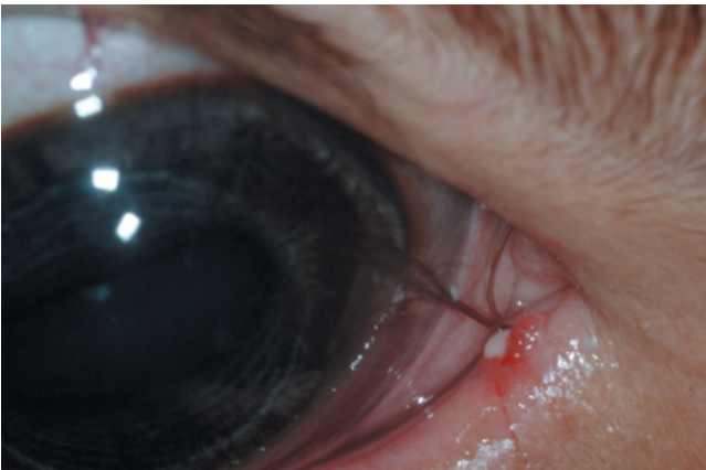
Figure 3. A couple of long brown hairs grew out of the inferior punctum.